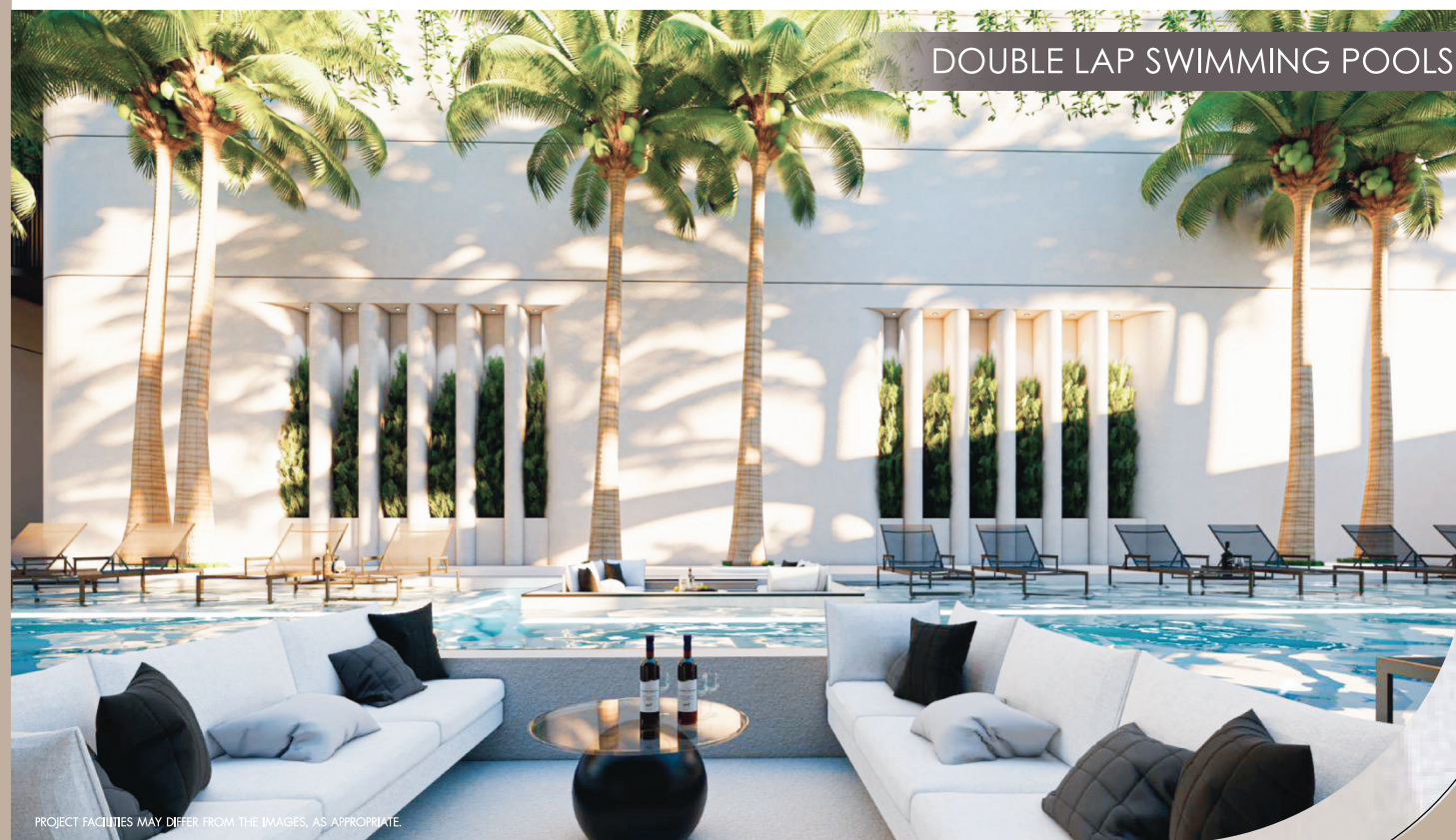
DOUBLE LAP SWIMMING POOLS

* THIS IMAGE IS A MONTAGE USED TO SIMULATE THE OVERALL CONCEPT OF THE PROJECT.